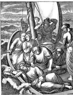
JESUS ASLEEP IN THE STERN.

A few editorials, blog posts, and other commentaries of late have declared “languishing” as the “mood,” or dominant emotion, of 2021. This is not depression, but rather a series of emotions that wear away at our sense of purpose and